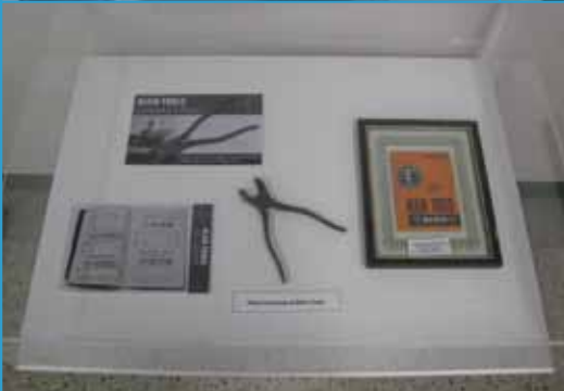
Historic 1926 pliers on loan from Klein Tools of Lincolnshire, Illinois, the leading tool maker in the electric industry, is paired in this exhibit with a 1954 Klein catalogue on loan from the International Lineman's Hall of Fame in Shelby, North Carolina.