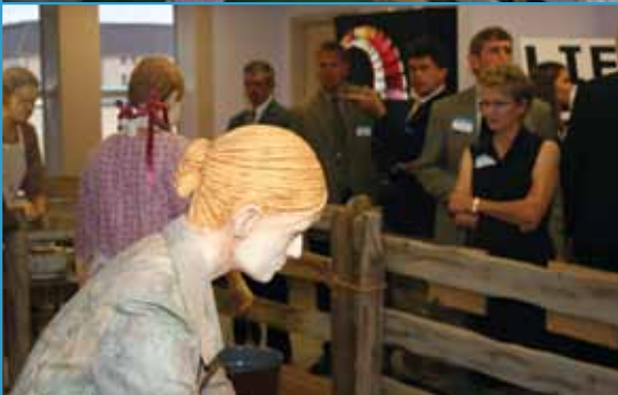
Attendees looking at the portrayal of the daily hardships families experienced before the advent of electricity.