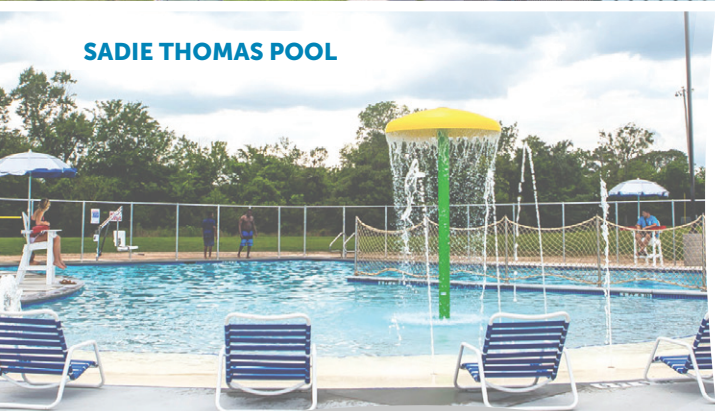
SADIE THOMAS POOL

To learn more about pools, visit: bryanparksandrecreation.com