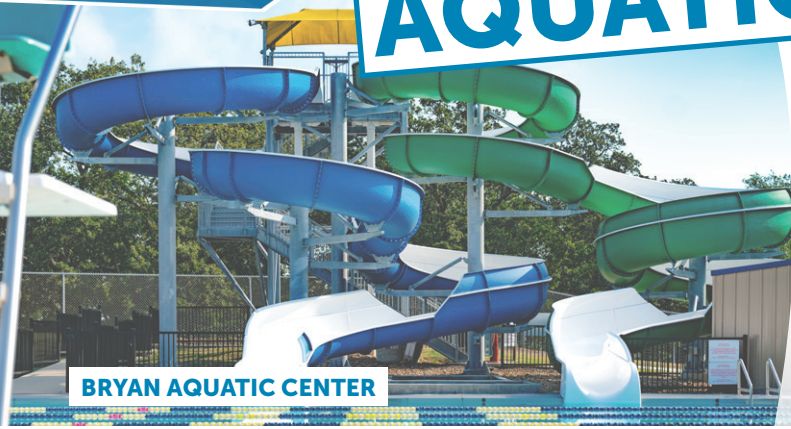
BRYAN AQUATIC CENTER